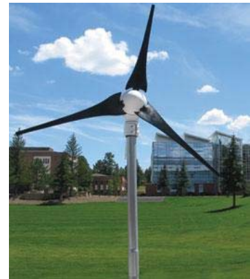
Northern Arizona University is one of more than 600 colleges and universities that have signed up to an agreement to go 'green'.